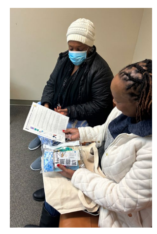
CMCH distributes cold and flu prevention kits along with COVID-19 prevention information. Kit instructions are published in five languages.