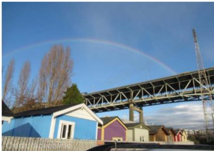
Northlake village next to Highway I-5