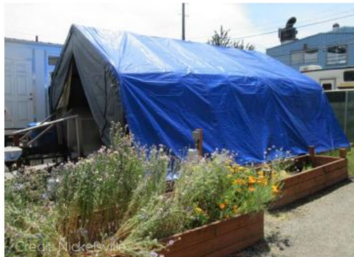
Northlake village's kitchen and raised garden beds