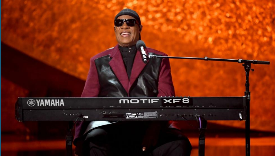
Stevie Wonder Higher Ground

“Don’t you let nobody take you to a low level Just keep on and keep on until you reach higher ground”