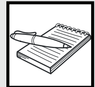
pen and paper