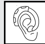
assistive listening devices