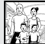
get my family